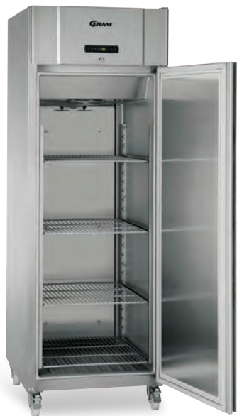
Robust construction, high specification The external front and side walls, inside of the door and shelf wall rails are stainless steel.