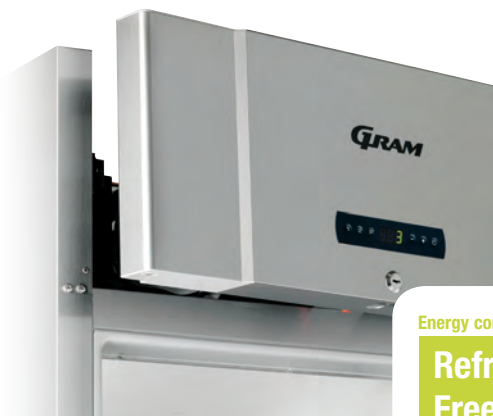
Easy maintenance and service There is easy access to the replaceable dust and grease filters. The compressor and refrigeration system is housed in the unique easy to service Gram plug-in unit.